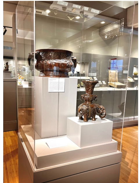
Cabinet of Bronze Figures

A green-glazed maebyeong (plum) vase with chrysanthemum design inlaid from the Goryeo Dynasty (918 – 1392).