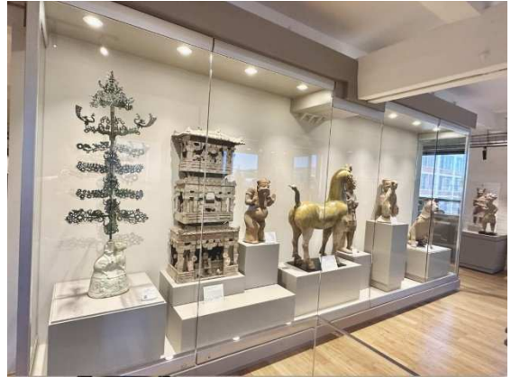
Han Funerary Wares Cabinet 漢朝櫃子

This cabinet holds an impressive collection of jades, including white, russet, black and white, and celadon jades. The collection spans thousands of years, from archaic jades to jades of the Qing dynasty (1644 - 1911).