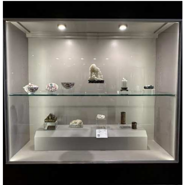
Cabinet for Qing Jade/Porcelain

This cabinet contains an array of contemporary Japanese netsuke figures.