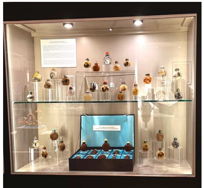
Carved Chalcedony Agate Snuff Bottles 瑪瑙雕刻鼻煙壺