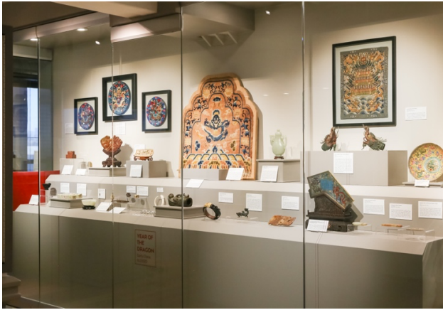
Year of the Dragon Collection Cabinet 龍年主題展櫃

This cabinet highlights the broad variety of artifacts that are part of the 'Year of the Dragon: Early China to LEGO' exhibition, including jade, ceramics, seals, carved ivory objects, and textiles.