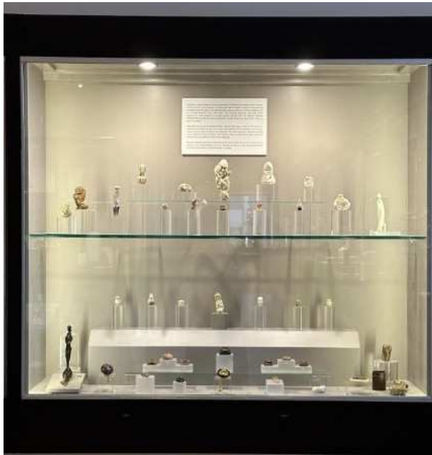
Japanese Netsuke Cabinet

This cabinet contains an array of contemporary Japanese netsuke figures.