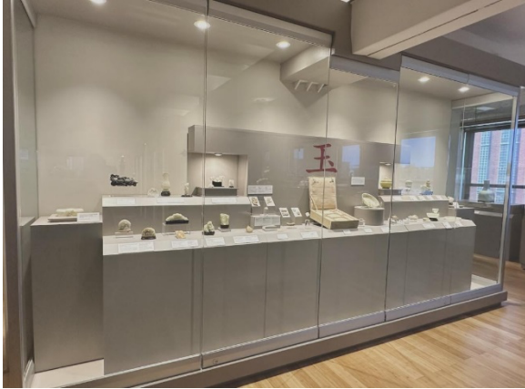
Jade Cabinet 玉櫃

This cabinet holds an impressive collection of jades, including white, russet, black and white, and celadon jades. The collection spans thousands of years, from archaic jades to jades of the Qing dynasty (1644 - 1911).