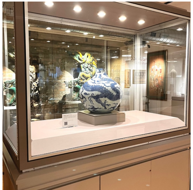
Dragon Vase Cabinet 龍紋天球瓶青花瓷展櫃

This cabinet displays a set of dragon sculptures and vases from Japan, as well as an embroidered dragon robe from China, representing the auspicious meaning of the dragon in East Asian cultures.