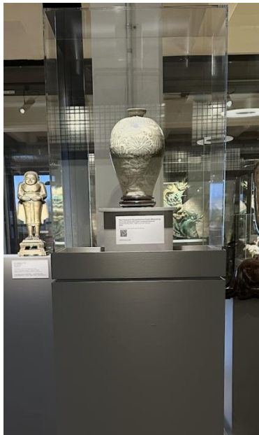
Cabinet of Goryeo Korean Celadon Vase

A pair of Sancai -glazed (three color) tomb guardians from the Tang Dynasty (618 - 906).