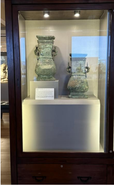
Cabinet for Pair of Fang Hu with Lids

Ancient Chinese bronze vessels from Spring and Autumn Period (771 BCE – 475 BCE).