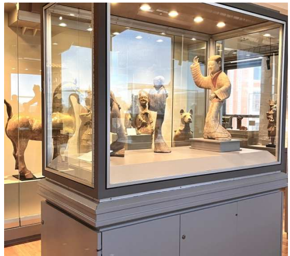
Han Dance Group Cabinet 漢朝舞蹈人物群櫃子

This cabinet houses painted tomb guardians in dynamic poses and powerful symbolism from the Northern Wei (386 - 534) and Tang (618 - 906) dynasties.