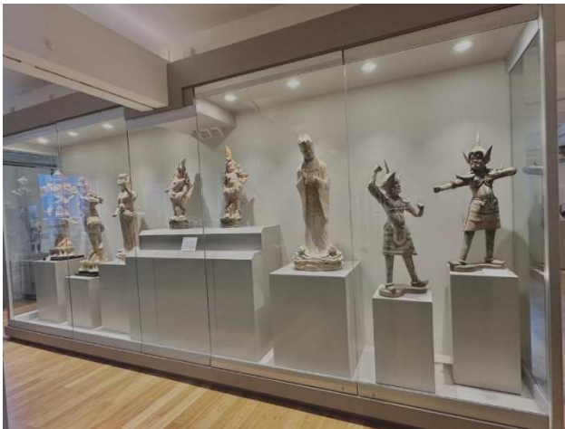
Tang and Wei Painted Guardian Sculptures ( Lokapala ) 唐魏八將陶塑展櫃

This cabinet displays treasures from the Han dynasty (206 BCE – 220 CE), highlighting early China’s social life, food, culture, economy, and more through funerary objects encapsulating life through death.