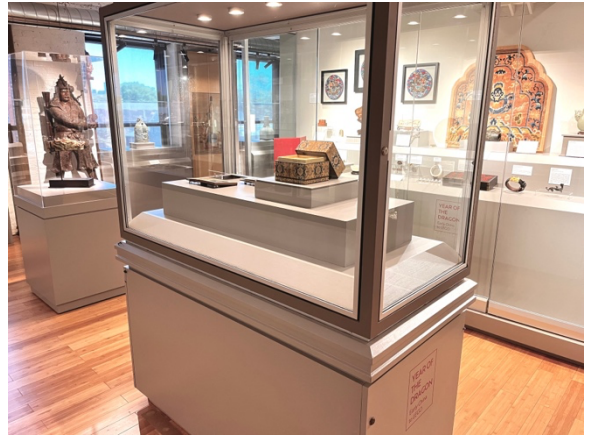
Qing Dynasty Qianlong Jade Discs Cabinet 清朝乾隆玉璧櫃子

This cabinet highlights the broad variety of artifacts that are part of the 'Year of the Dragon: Early China to LEGO' exhibition, including jade, ceramics, seals, carved ivory objects, and textiles.