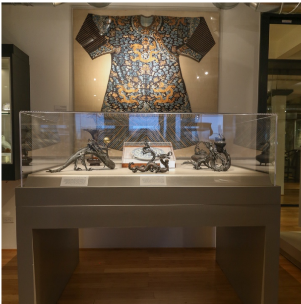
Dragon Robe and Sculptures Cabinet 龍雕塑與龍袍展櫃

This cabinet holds a pair of albums within zitan covers and Jade Discs, illustrating the aesthetic pinnacle of the Qianlong Rule of Qing China.