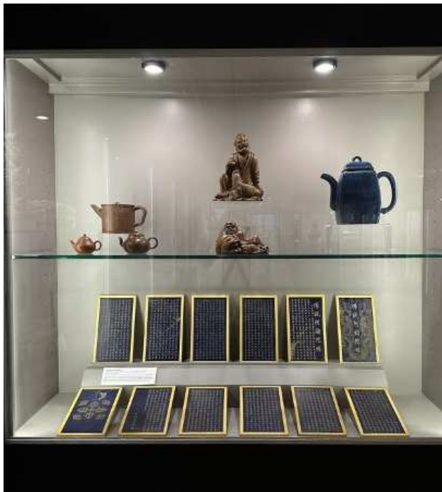
Cabinet of Teapots, Buddhist Sutras and Buddhas

This cabinet includes a twin badgers carved jade ornament from the Qing Dynasty, a pair of porcelain dragon bowls, additional carved jades, and a gilt bronze figure.